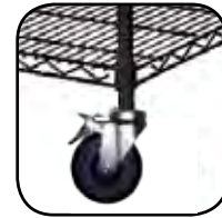
Mobile Posts (caster not included)