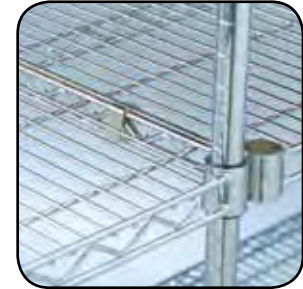
Add-On Units can be added using S-Hooks to create even shelf additions