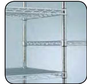
Utilize common posts to connect multiple units